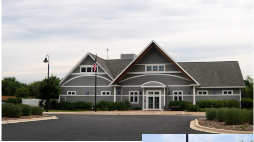
Renwood Golf Course 701 E. Shorewood Rd., Round Lake Beach

For the love of pie, come and burn some calories at our inaugural Turkey Trek! This 2-mile (approx.) Fun Run takes place at our scenic Renwood Golf Course, so prepare for various types of terrain, including gravel, grass, pavement, even snow. After the race, stop by the clubhouse for refreshments and a slice of pie. All proceeds will benefit the RLAPD "Fun"ds for Recreation Scholarship Program.