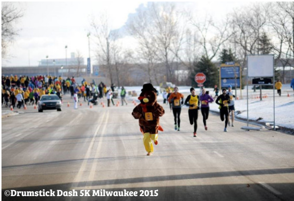
© Drumstick Dash 5K Milwaukee 2015