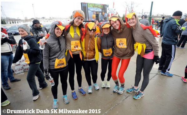
© Drumstick Dash 5K Milwaukee 2015

The first 150 registrants will receive a fun promotional item!